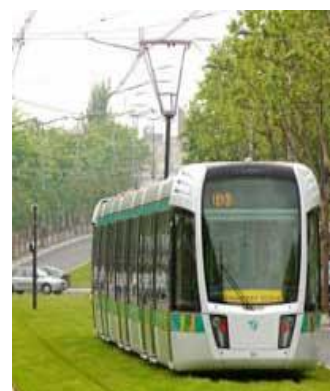
Tram in operation on line T3 in Paris